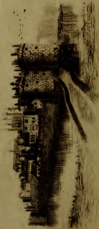
Tower of London 12 From an old print of the British Museum